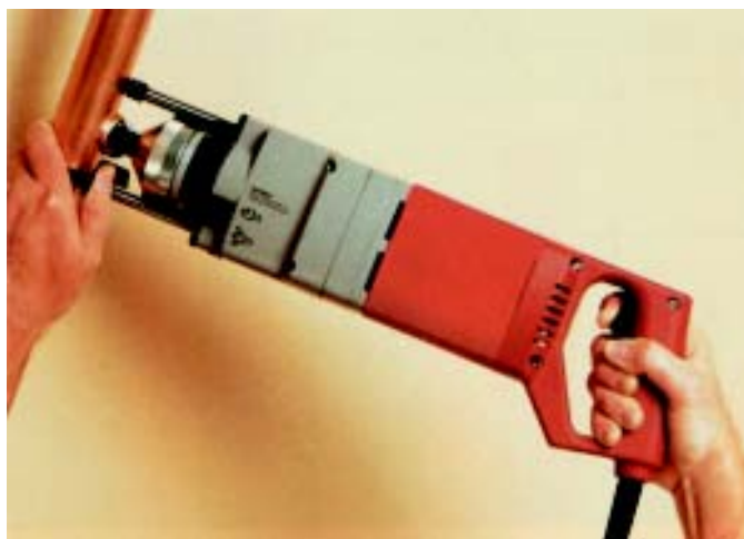
Figure 6. Hand-held tool for pulling outlets to quickly form tee connections.