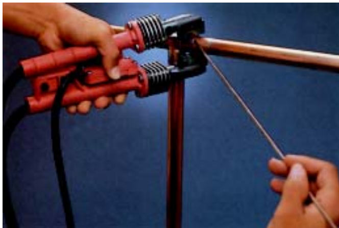
Figure 5. Electric resistance hand tools are suitable for joining copper tube.

Buildings with Light Hazard Occupancies are often designed with severe mechanical space limitations. Copper's excellent properties not only allow smaller pipes to be used ( see Figure 8 ), but also allow the tube to be bent to bypass obstructions if necessary. Connections are clean and easy and can be made in very tight spaces. This becomes a significant advantage in retrofit installations. Frequently, details of the actual construction site may not exactly match the drawings. Last minute design changes may be needed. If copper is used, job changes are rarely a problem because the system can be adjusted in the field to accommodate variations from the plans. Only changes that are within the limitations of your hydraulic calculations should be made.