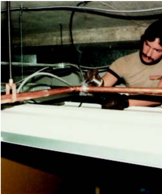
Figure 1. Copper fire sprinkler system in a commercial building being installed with electric resistance heating.