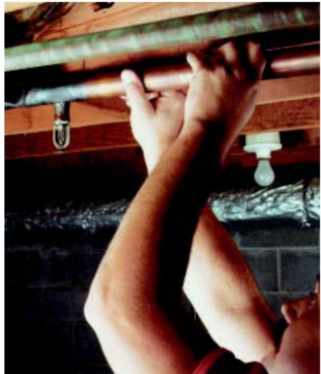
Figure 2. Copper is very effective in residential applications, such as this multi-family unit.