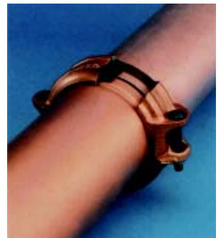
Figure 7. Mechanical grooved-end joining system for copper piping.