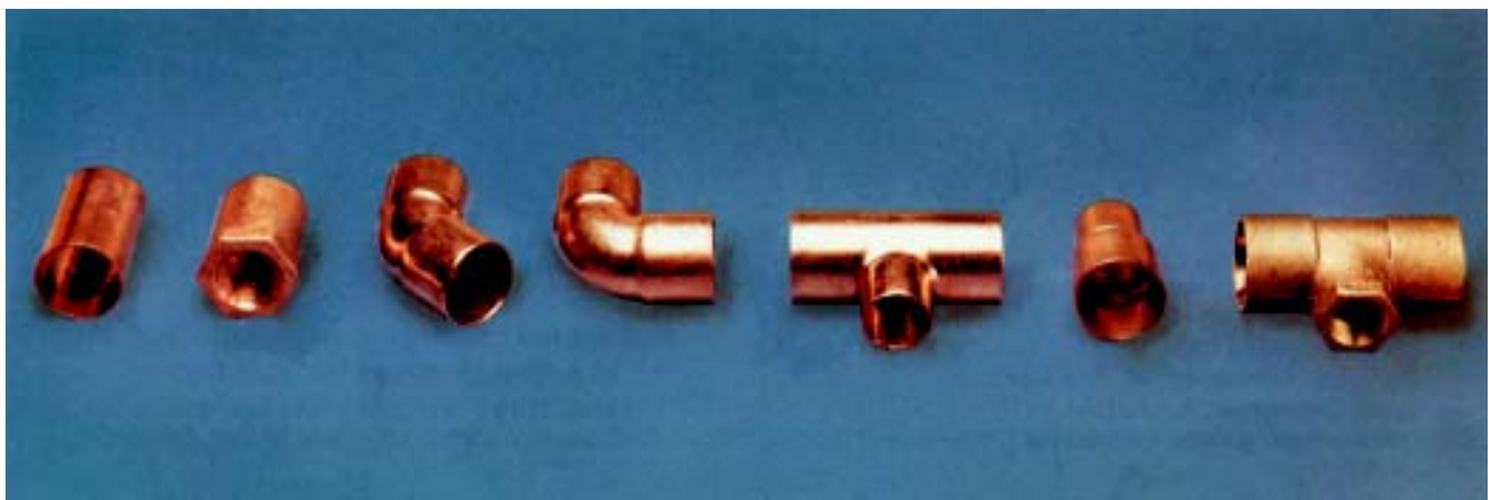
Figure 4. Typical fittings used in copper fire sprinkler installations.